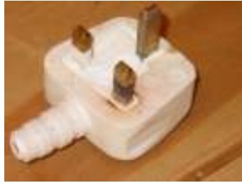
Burnt plug pin

Always do a visual inspection. If the plug is burning on the pins, as photo below, replace.